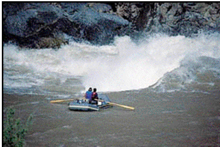
The Big Hole at Crystal Rapid on the Colorado River in the Grand Canyon!

In the case of very difficult whitewater, you may want to have a good deal of information about the situation available, have a plan for other observers to share their thoughts on how to succeed and even have a plan for someone to throw you a rope if things get really tight. And sometimes scouting that rapid is in order so that the difficulties can be avoided or responses can be planned: